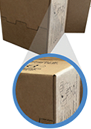
Staggered folds are integrated to give our sample box a truly flat bottom.