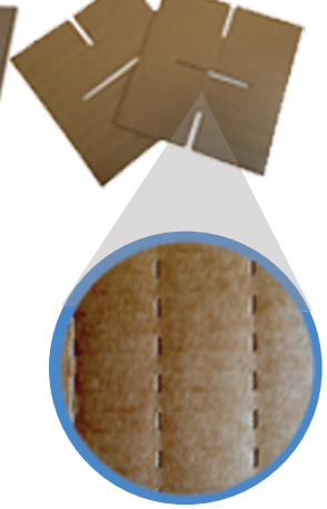
New single perforated line makes it easier to fold and assemble.