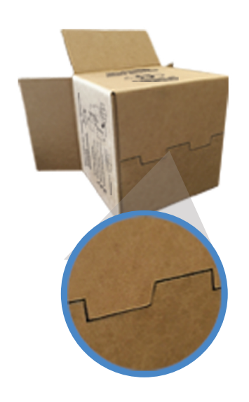
New interlocking tabs offer foolproof assembly and ensures a truly square box.

THE GROUT SAMPLE BOX provides specimens that are ready for testing. It yields flat surfaces with perpendicular sides to the tops and bottoms, whereas the pinwheel method usually yields specimens that need to be trimmed and cut before testing. Meets ASTM C1019, Section 6.