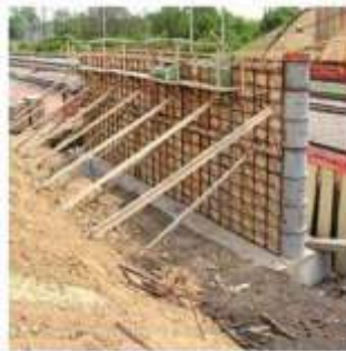
Deslauriers forms used in "Bullnosing" application.