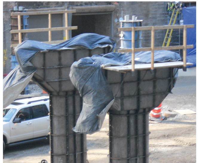
Scaffold Bracket in use on lower Wacker Drive in Chicago, IL.